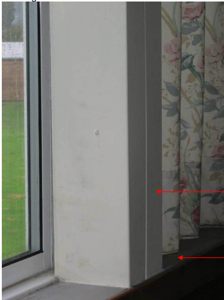
Photo 1 - Metal clad column showing gap at front of column where the two halves of the cladding meet.